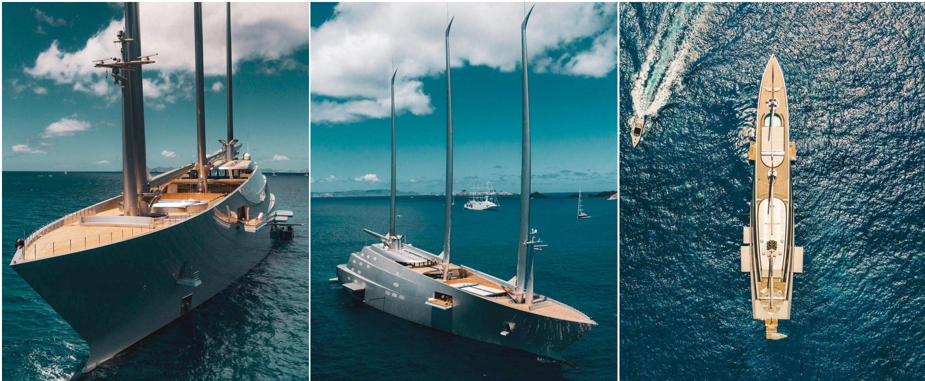
Sailing Yacht "A" – currently largest sailing yacht LOA 142m

Project no. 609675-EPP-1-2019-1-ME-EPPKA2-CBHE-SP