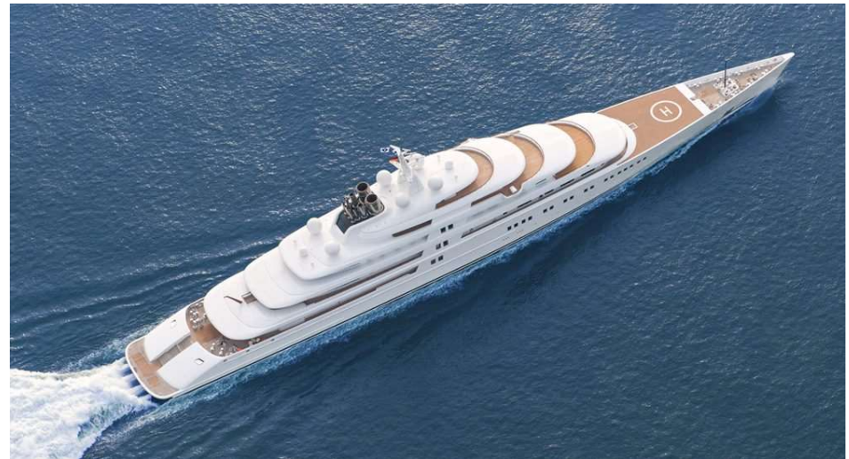
Motor Yacht "Azzam" – currently largest motor yacht LOA 180m

Project no. 609675-EPP-1-2019-1-ME-EPPKA2-CBHE-SP