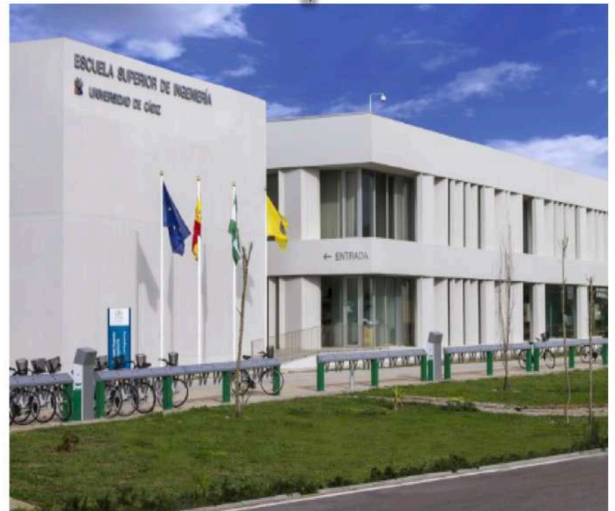
Escuela Superior de Ingeniería