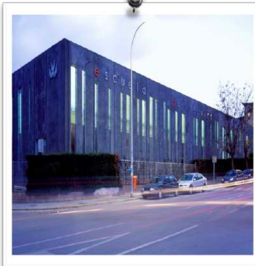
Escuela Politécnica Superior