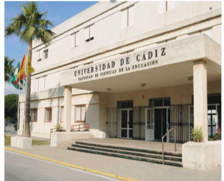
Facultad de Ciencias de la Educación