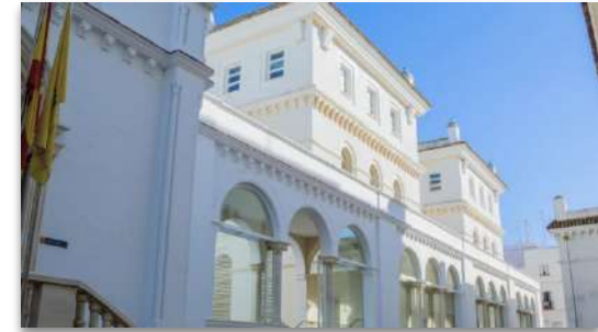
Facultad de Ciencias Económicas y Empresariales