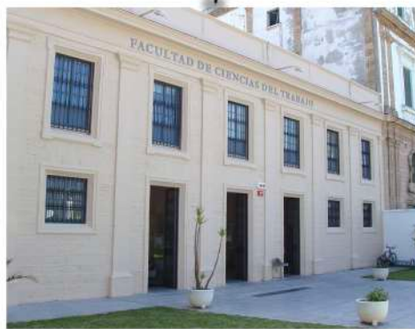
Facultad de Ciencias del Trabajo