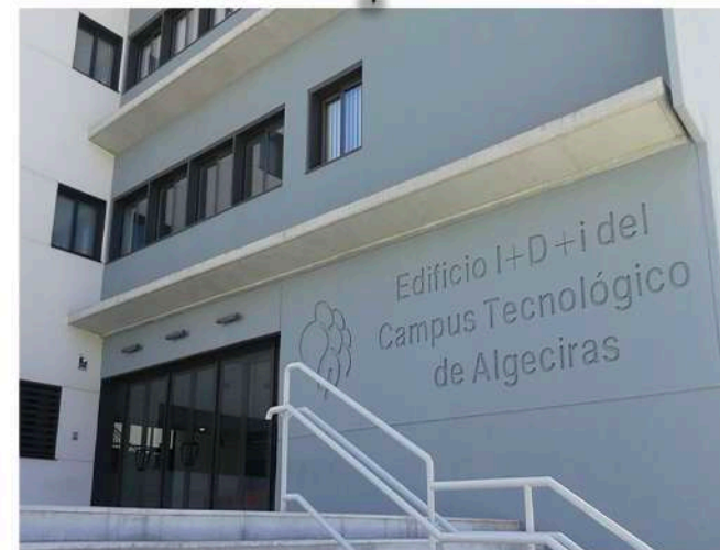
Sede Algeciras Facultad de Derecho