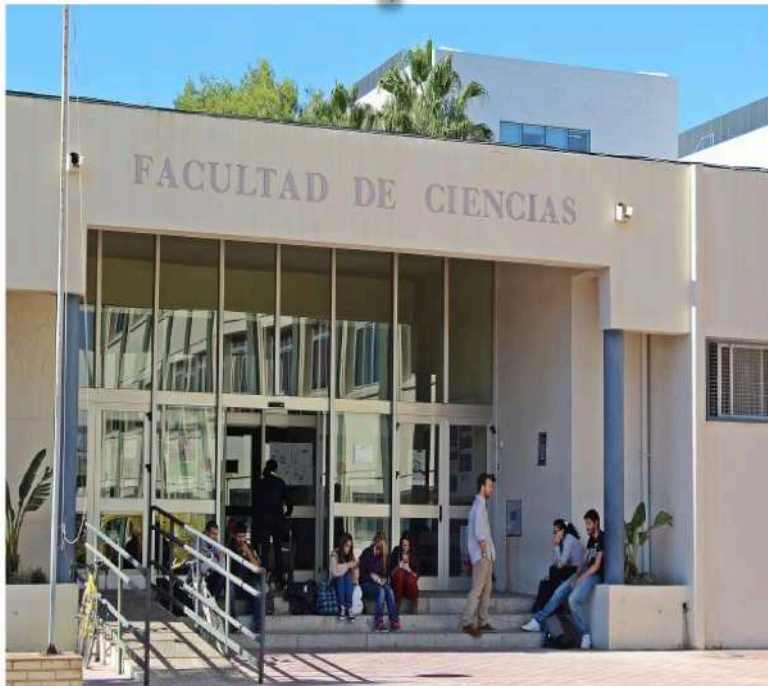
Facultad de Ciencias