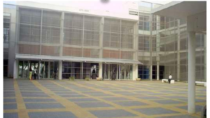
Facultad de Ciencias sociales y de la Comunicación