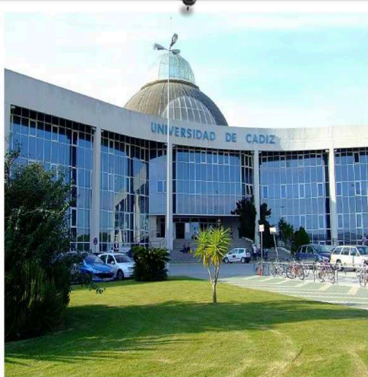
Escuela de Ingenierías Marina, Náutica y

Radioelectrónica.Facultad de Ciencias del Mar y Ambientales