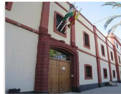
Facultad de Filosofía y Letras