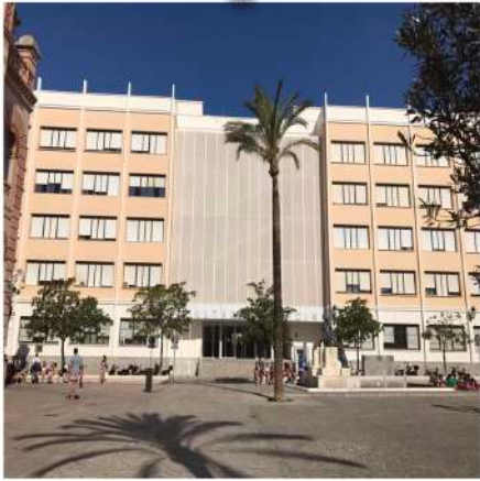
Facultad de Medicina