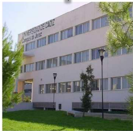
Facultad de Derecho