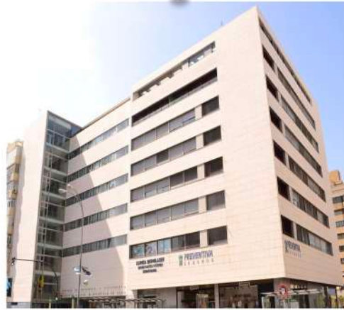
Facultad de Enfermería y Fisioterapia