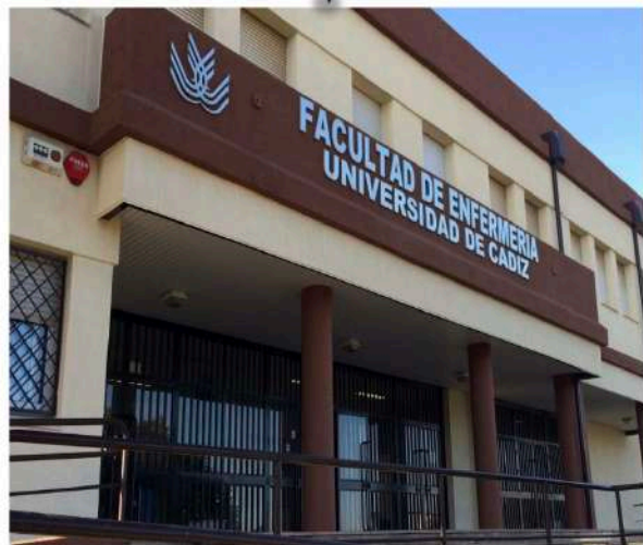
Facultad de Enfermería